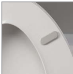
SUPER GRIP BUMPERS™