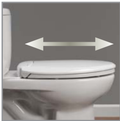
PRECISION SEAT FIT™ 1" ADJUSTABLE HINGES