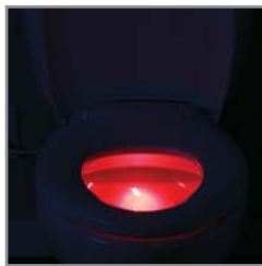
BUILT-IN NIGHT LIGHT FEATURE