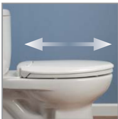
PRECISION SEAT FIT™ 1" ADJUSTABLE HINGES