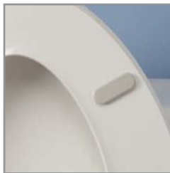
SUPER GRIP BUMPERS™