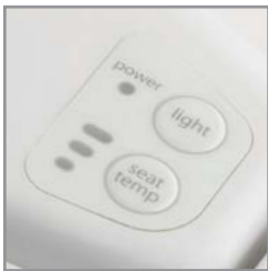
MULTI-SETTING WARMING SEAT