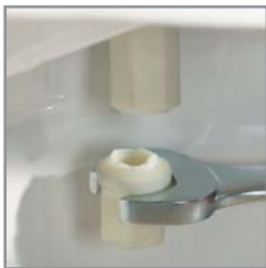
STA-TITE® SEAT FASTENING SYSTEM™